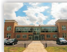
Bedfordshire Clinical Commissioning Group Capability House, Silsoe, Bedfordshire, MK45 4HR www.bedfordshireccg.nhs.uk/page/?id=3250

We desperately need a doctor and a medical centre in the Wixams. The response from the Bedfordshire Clinical Commissioning Group (BCCG) that something may happen in three years time is simply not good enough.