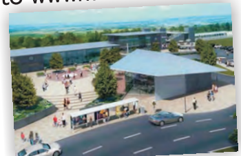
The Wixams Train Station as described in the Gallaher Wixams Newsletter Spring 2015