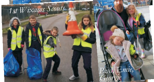
1st Wixams Scouts