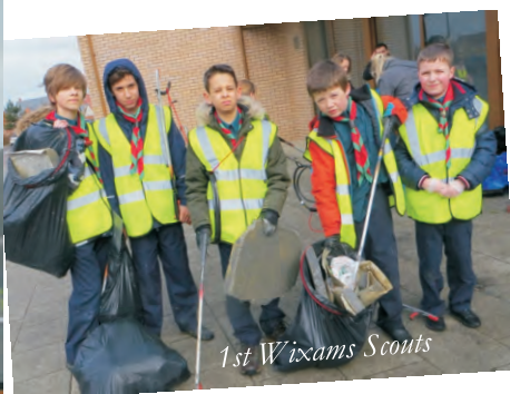
1st Wixams Scouts