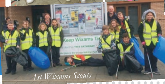
1st Wixams Scouts