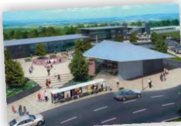
The Wixams Train Station as described in the Gallagher Wixams Newsletter Spring 2015

Cllr Coombes advised that the s106 agreement with Gallaghers to put aside £13.4m to build a train station runs out in 2019. Network Rail think £27m is required for the build the bulk of which is needed to realign the track and install overhead cables. This leaves a short fall of approx. £13.5m. BBC needs to ask CBC for further funding but Cllr Coombes suggests BBC is not trying hard enough to secure the station.