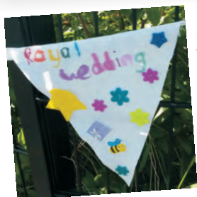
Flags celebrating the Royal Wedding at Dane Dane play area - by the Brownies