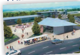
The Wixams Train Station as described in the Wixams Newsletter Spring 2015