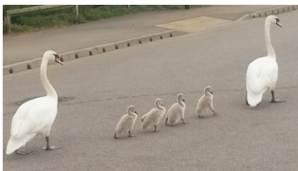
Walking down Green Lane