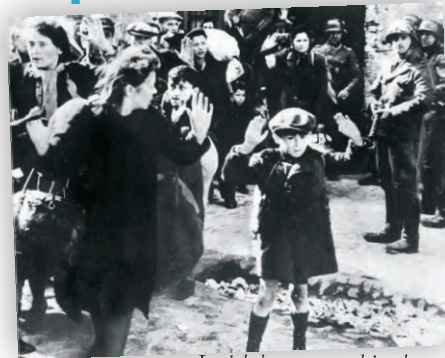
Jewish boy arrested in the Warsaw ghetto by the SS, 1943

On Holocaust Memorial Day, 27th Jan. we remember the six million Jews murdered in the Holocaust, and the millions of people killed under Nazi Persecution, and in the genocides which followed in Cambodia, Rwanda, Bosnia, and Darfur.