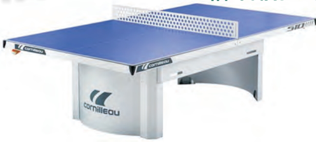
Table Tennis outdoors in Wixams

An outdoors table tennis table is being funded for the use of Wixams children, teenagers and adults. The money has been made available through Cllr Graeme Coombes.