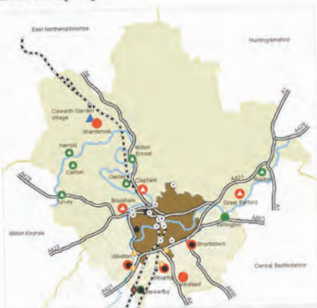
Local Plan Key Diagram

Bedford Borough Council has published a new draft local plan for six weeks of public consultation until Monday 5th March. Your comments on the local plan are invited.