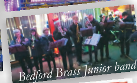
Bedford Brass Junior band