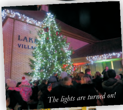
The lights are turned on!